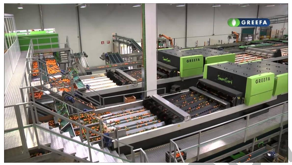
Figure 4: Greefe Robotic Sorting Machine.