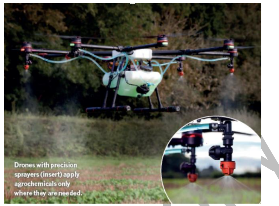
Figure 3: Drone crop sprayer.