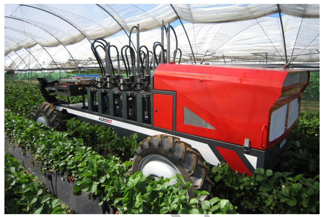
Figure 2: Agrobot.

Many of the tasks that agricultural robots perform are operations which were previously performed by human labourers. While this advent has both pros and cons, it seems inevitable that as artificial intelligence becomes more powerful, human involvement in tasks such as recognising ripe fruit or manually operating a machine will become less valuable. As costs of robotics fall, opportunities for farm labourers seem likely to decline in frequency.