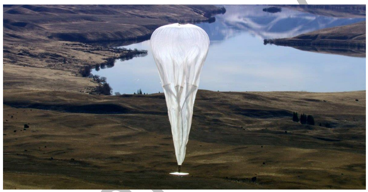
Figure 2: Google Loon Balloon

recognition and video analytics, is not possible in remote agricultural regions via 3G networks or worse. If these companies succeed in being the network providers to the planet, the disruption for many industries and incumbents would be significant. At present, these projects are not feasible due to the sheer cost to roll out so much infrastructure. Elon Musk has received scorn for his plans as being overly ambitious. However, if recent history has taught us anything, it is that this type of world-changing innovation is deceptively fast, and any industry would be remiss to write-off the possibility of ubiquitous internet access in the recent future.