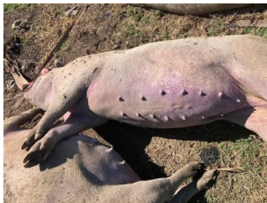
Figure 3: Pigs that died of African swine fever near George showed red patches of skin on their undersides

Salmonella Enteritidis was isolated from chick crates and dead-in-shell chicks on three commercial broiler farms in the Worcester and Malmesbury areas.