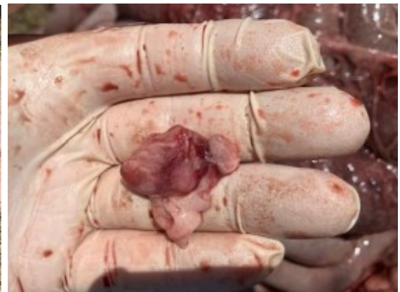
Figure 4: Haemorrhagic lymph node from a pig that died of African swine fever near George

Epidemiology Report edited by State Veterinarians Epidemiology: