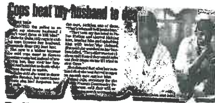
Daily Sun, 11 January 2012

He said he believes there is concrete evidence against the officers.